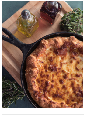
MSU RETIREES ASSOCIATION MONTHLY INFORMAL LUNCH When Friday, Oct. 13, 2023 Time 11:30 a.m. - 1:30 p.m. Where Brody Hall Cafeteria Program None — just social time with your fellow retirees

MSURA had its early beginning with retirees meeting for lunch. Many retirees meet regularly with their fellow retirees for breakfast, lunch or dinner. As we begin our 75th anniversary year, we thought having a reoccurring common lunch where retirees can socialize and reconnect was a good idea. Plan