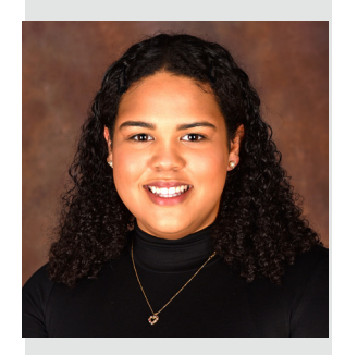
BY JATASIA POWERS

JaTasia Powers is a double major in media journalism and mass communication. She hopes to have a career as a music journalist when she graduates.